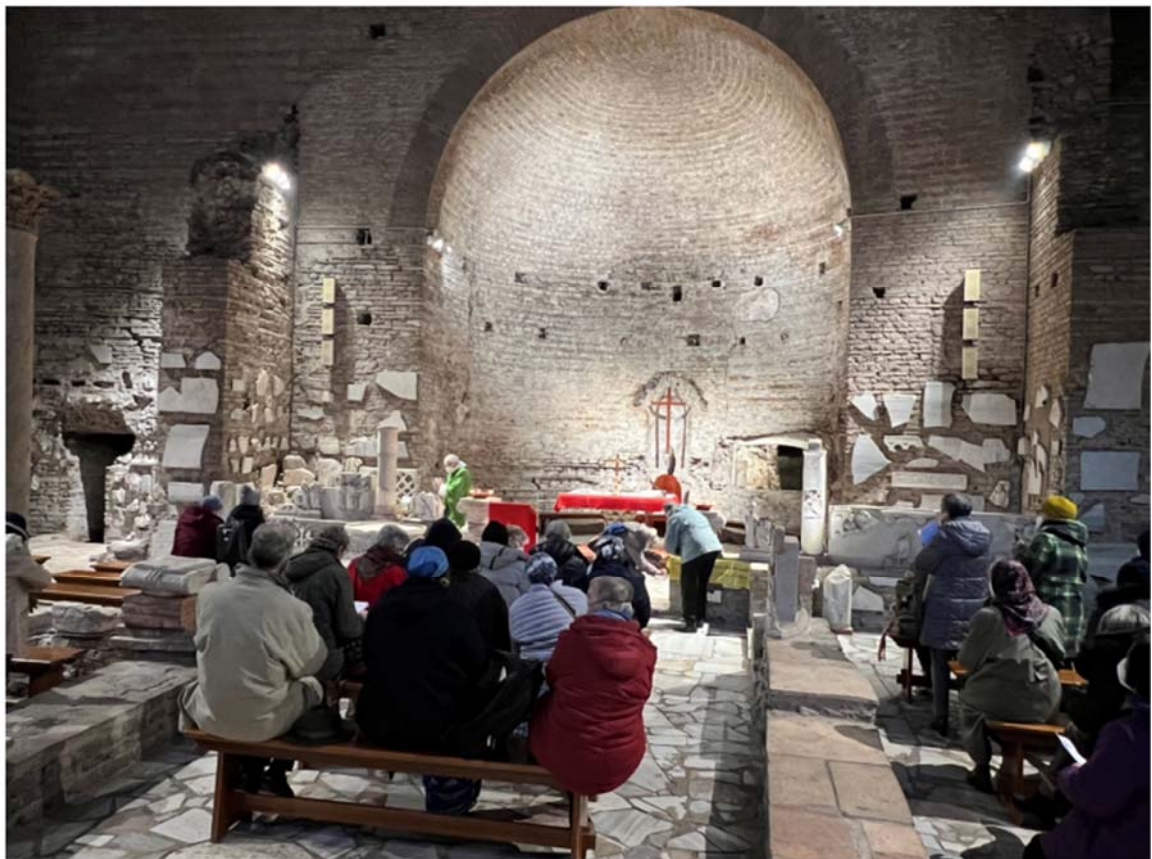
16 th January 2022 – “Do what he tells you”