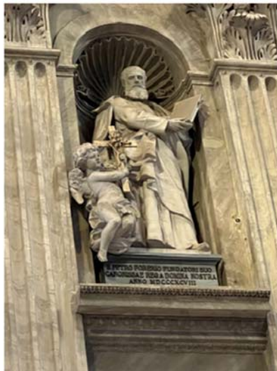
Saint Peter's Basilica