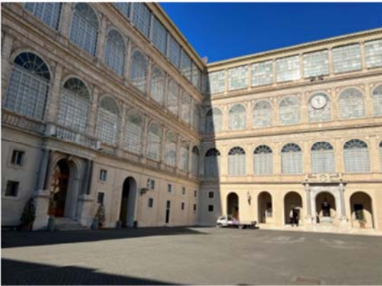
San Damaso Court