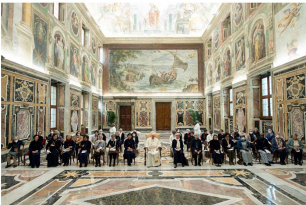
24 th January 2022 – Clementine Hall